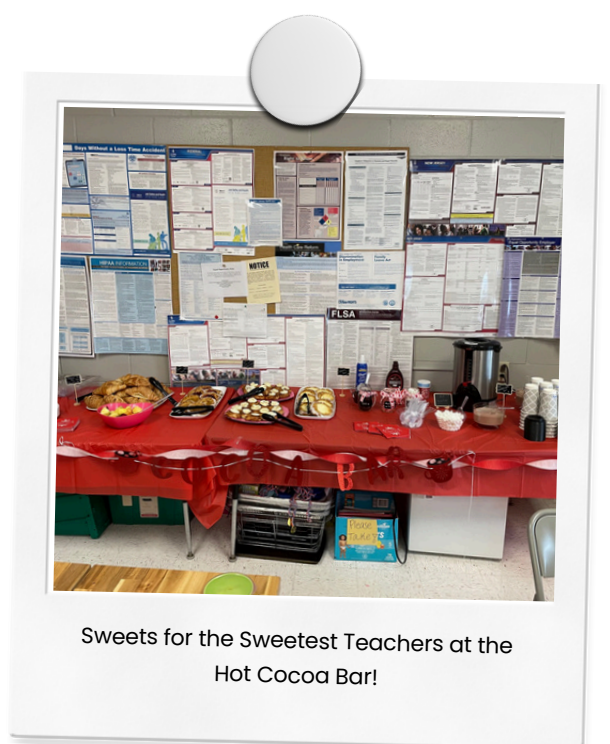
Sweets for the Sweetest Teachers at the Hot Cocoa Bar!