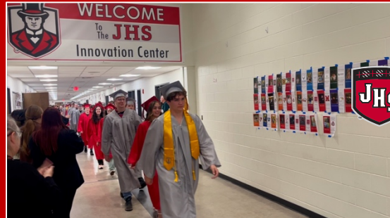
JHS Senior Clap Out

I have several weeks remaining as Johnstown-Monroe Superintendent, but this is the final edition of this publication during my tenure.