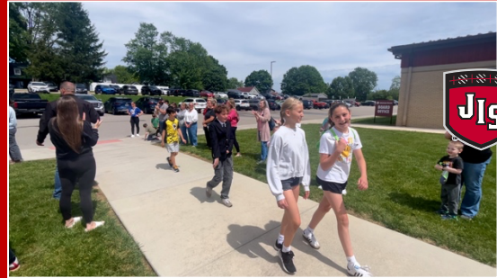
JIS 5th Grade Clap Out