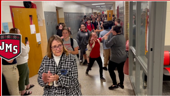
JMS 8 th Grade Clap Out