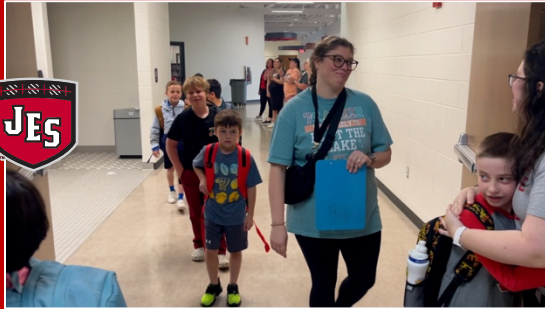
JES 3rd Grade Clap Out