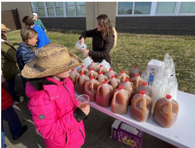
Students sample some fresh apple cider.