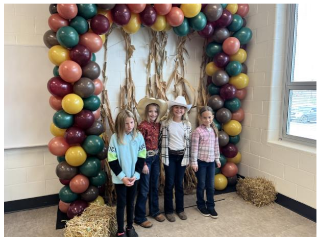
Students enjoy a harvest-themed "selfie-booth."