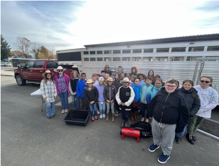
Students with a livestock transport trailer shared by Heimerl Farms.